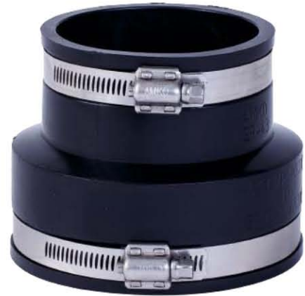
Flexible Couplings - Cast Iron, Plastic